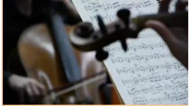
Click on photo to see video.